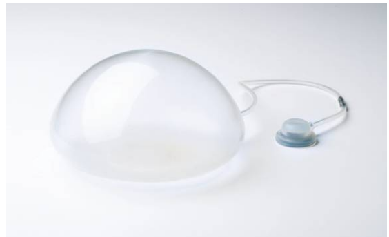
LS 83 Round shape