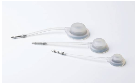
LS 84 Injection site range

To fill the expander with saline solution, we recommend a 22G Huber needle, not supplied with the expander, introduced perpendicular to the surface of the site and in the centre of it.