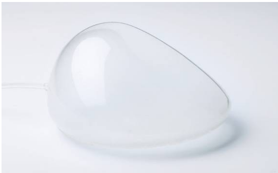
LS 89 Anatomical shape

Our sterile tissue expanders and remote-valve, single-use, are sold by the unit. They are class IIb medical devices.