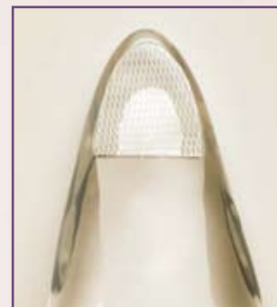
Pocket easing insertion

Our calf implants are sold sterile, single-use, by unit.