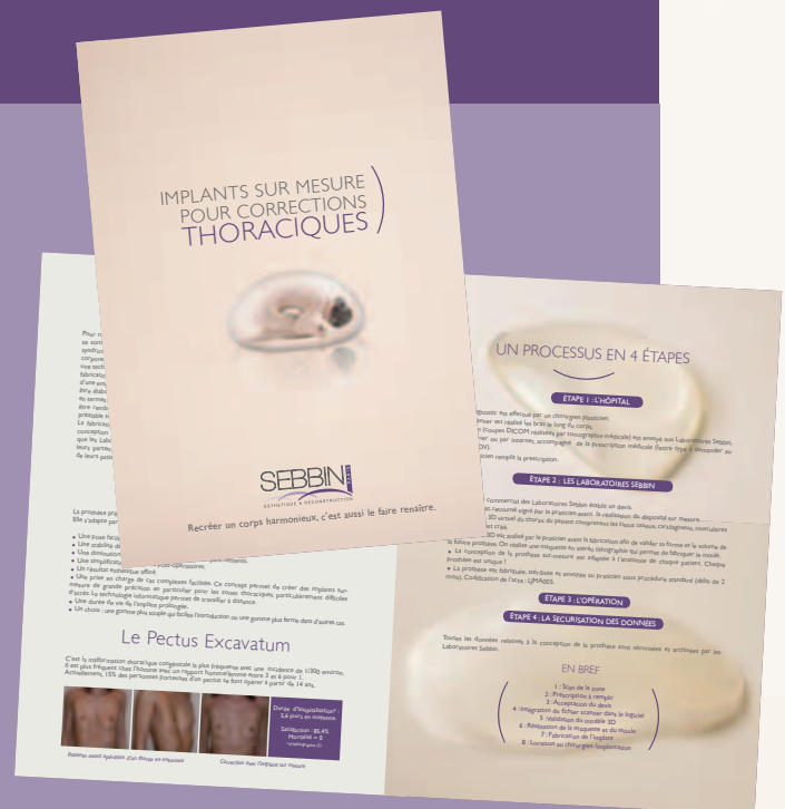
New Sebbin brochure on chest implants

Do not hesitate to contact us to find out more.